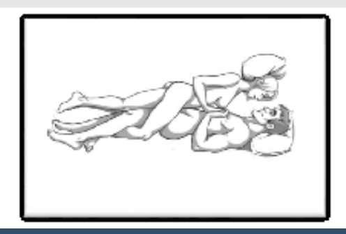
Figure 8: Face to face side by side position