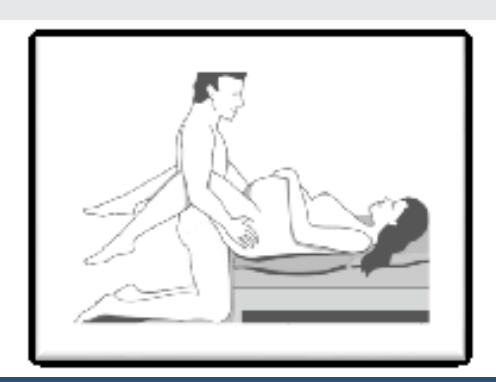
Figure 10: Edge of the bed.