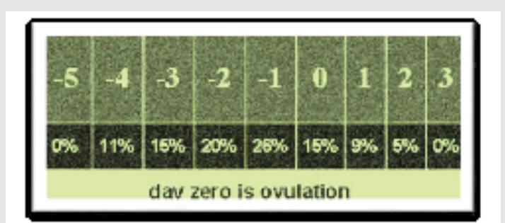
Figure 2: The chances of pregnancy by day of intercourse.

Today it is pretty easily understood that semen, once in contact with the cervix coagulates fairly quickly, even if much of it appears to ooze away. The force of ejaculation and the